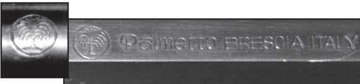
Here is an example of a manufacturer using two different styles. The stand-alone Palmetto palm tree logo on this screw barrel derringer, and the logo and company name on the barrel of this 1851 Navy.