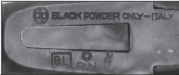
The underside of this screw barrel deringer manufactured by Pedersoli shows only the dp logo. Both proof house marks are present and a boxed BL denoting the year of manufacture as 1998.