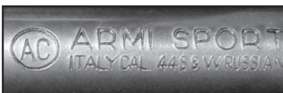
Armi Sport uses a circular device with the capital letters AC.

was followed by the image of an anvil with PEDERSOLI above it in capital letters and the initials DAP inside the anvil. This again is rarely seen, except on very early models. The company logo, a lowercase dp within an oval, has been used for more than 40 years. This logo is often followed by the DAVIDE PEDERSOLI or PEDERSOLI name in capital letters. In short, there is no mistaking a Pedersoli product!