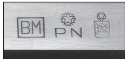
These are the three standard stampings on every Italian-made black powder revolver, pistol, rifle and shotgun. From left to right: year of manufacture, Gardone V.T. black powder proof house stamping, and Gardone proof house stamping. The year of manufacture is?

Davide Pedersoli, one of Italy's oldest manufacturers has had three logos since 1957. The earliest was a diamond inside a circle. This is rarely seen. This mark